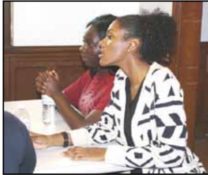
ConnCAP Students in Workshops during Academic Day at Spring Valley Farm

Students participating in the Academic Day held on October 18 were treated to a day at Spring Valley Student Farm, where they explored the farm and reflected on the importance of community service. The farm was established in spring 2010 through a collaboration between Dining Services, Residential Life, and First Year Programs and Learning Communities as an extension of the EcoHouse Learning Community. It is located just a few miles from the main campus but, according to the students, it felt like a world away from the hustle and bustle of daily life. The students spent part of the day learning about organic farming methods, tasting edible flowers, petting chickens, and hiking along the Willimantic River. In the afternoon, they participated in workshops facilitated by the brothers ( hermanos ) from La Unidad Latina, Lambda Upsilon Lambda Fraternity, Inc., which emphasized the importance of social responsibility.