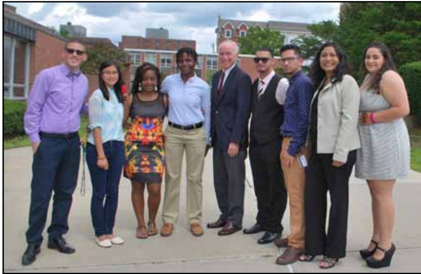
Congressman Joe Courtney with Students and Staff at SSS Closing Ceremony