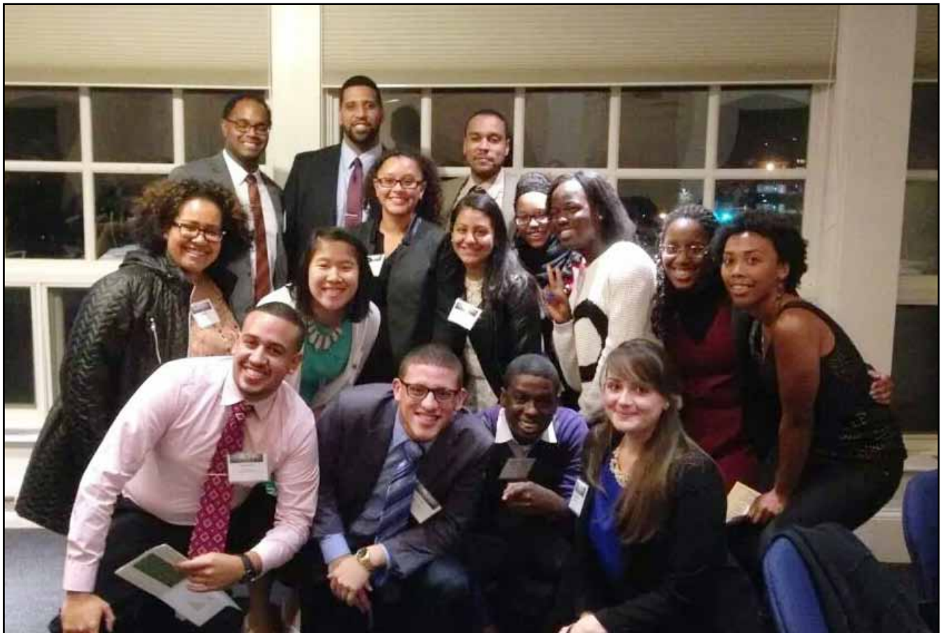
SSS students and Alumni at "Celebrate Diversity in Education" dinner

Over the years, many of UConn's SSS students have enrolled in and graduated from Neag's Teacher Education programs, becoming educators who greatly impact the lives of the students they work with. Events such as this are important, allowing for educators, new and aspiring, to come together in a spirit of community and diversity.