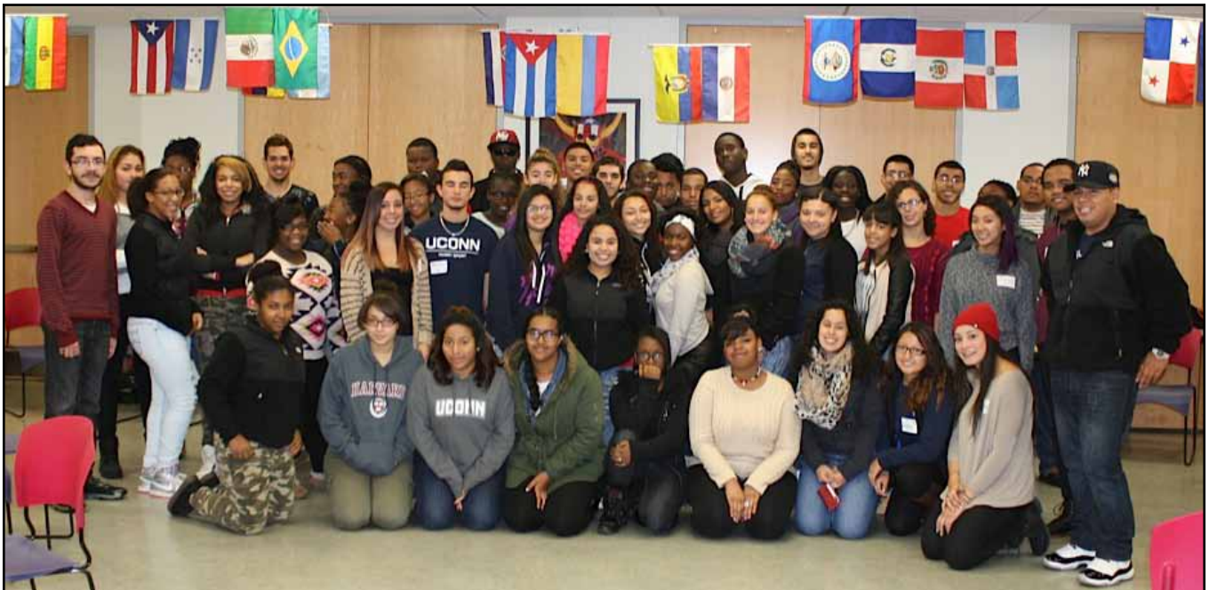
ConnCAP Students Visit UConn